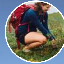
Field Ecology Research